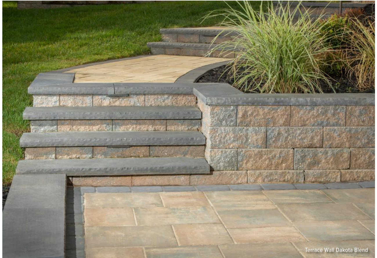
Terrace Wall Dakota Blend

Enlarged swatches on page 88 See pages 66-69 for cap options.