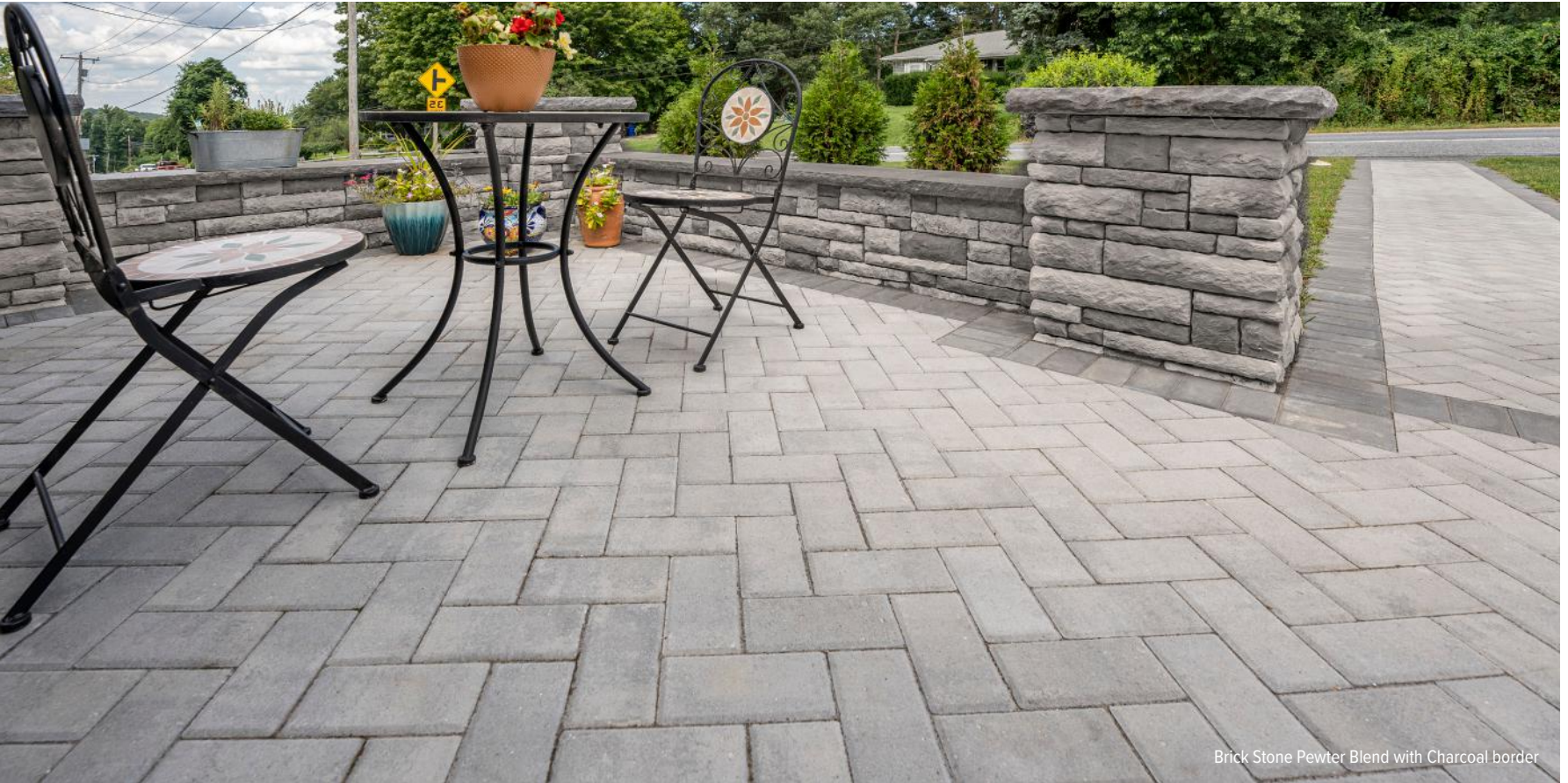
Brick Stone Pewter Blend with Charcoal border