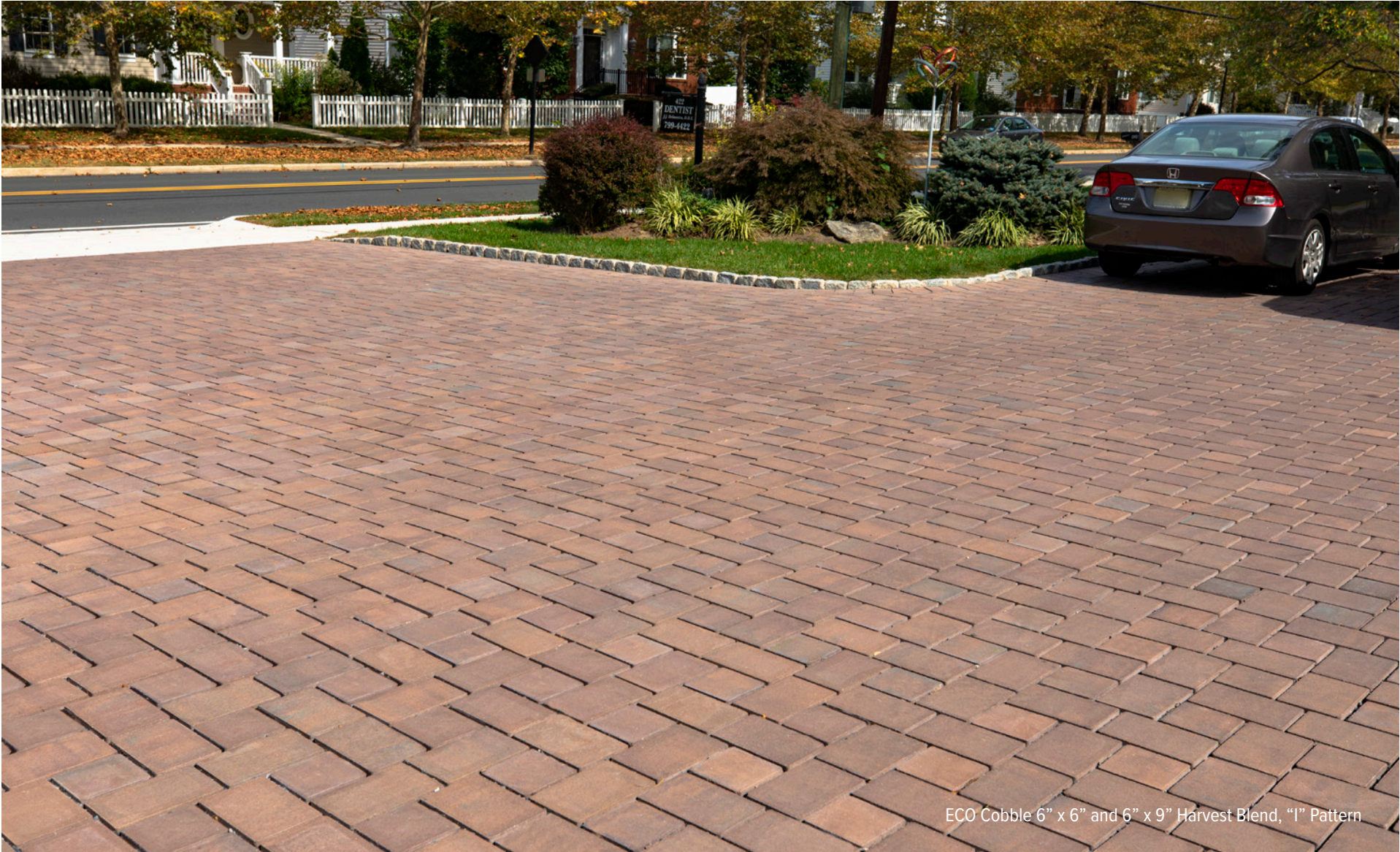
ECO Cobble 6" x 6" and 6" x 9" Harvest Blend, "1" Pattern