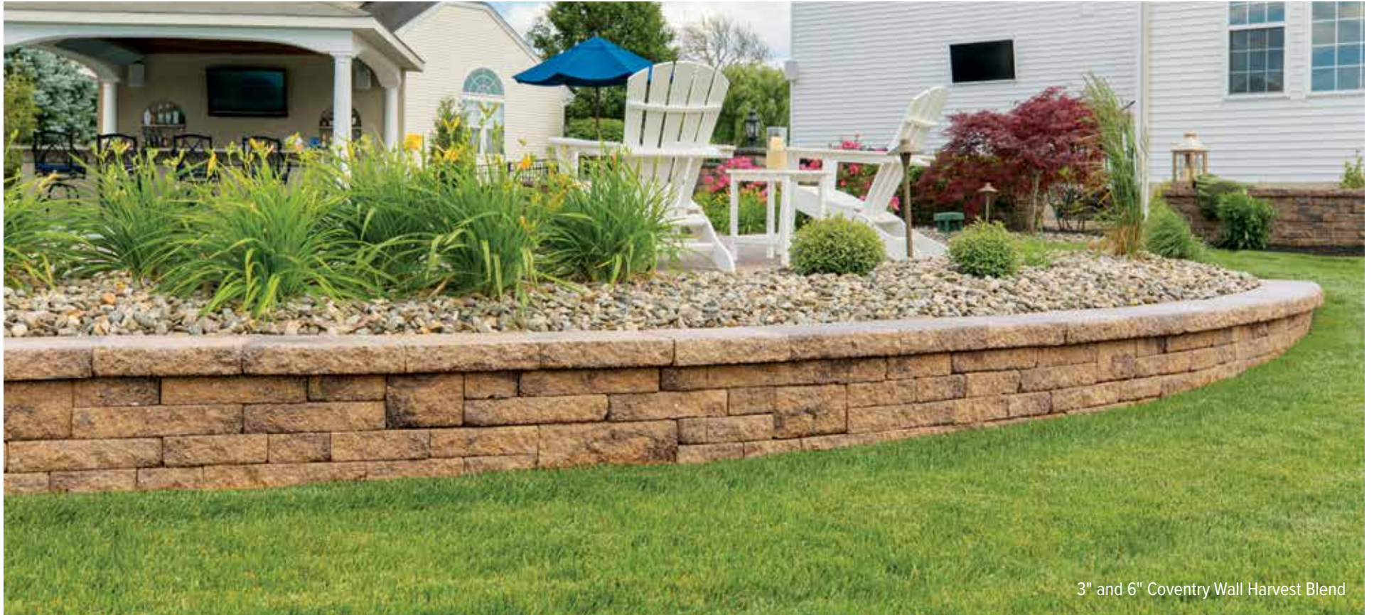
3" and 6" Coventry Wall Harvest Blend