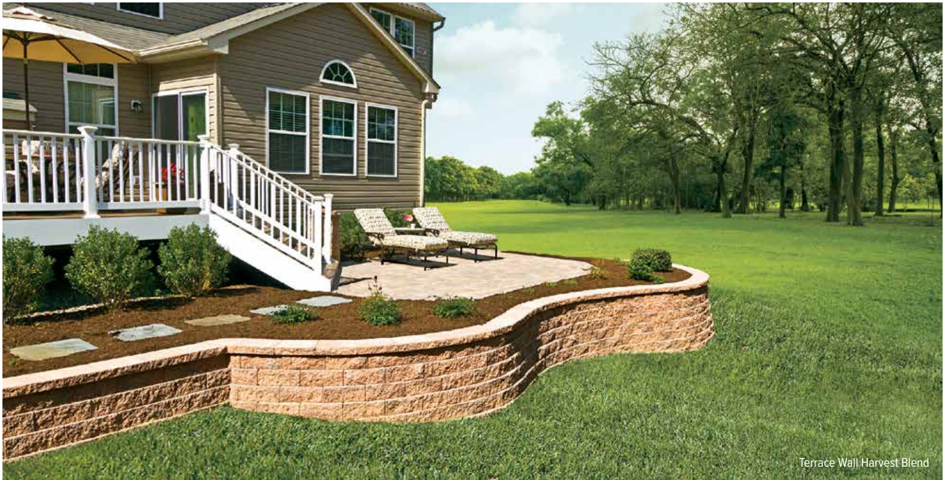
Terrace Wall Harvest Blend