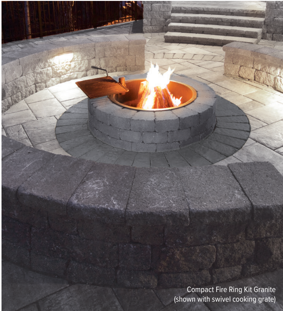
Compact Fire Ring Kit Granite (shown with swivel cooking grate)