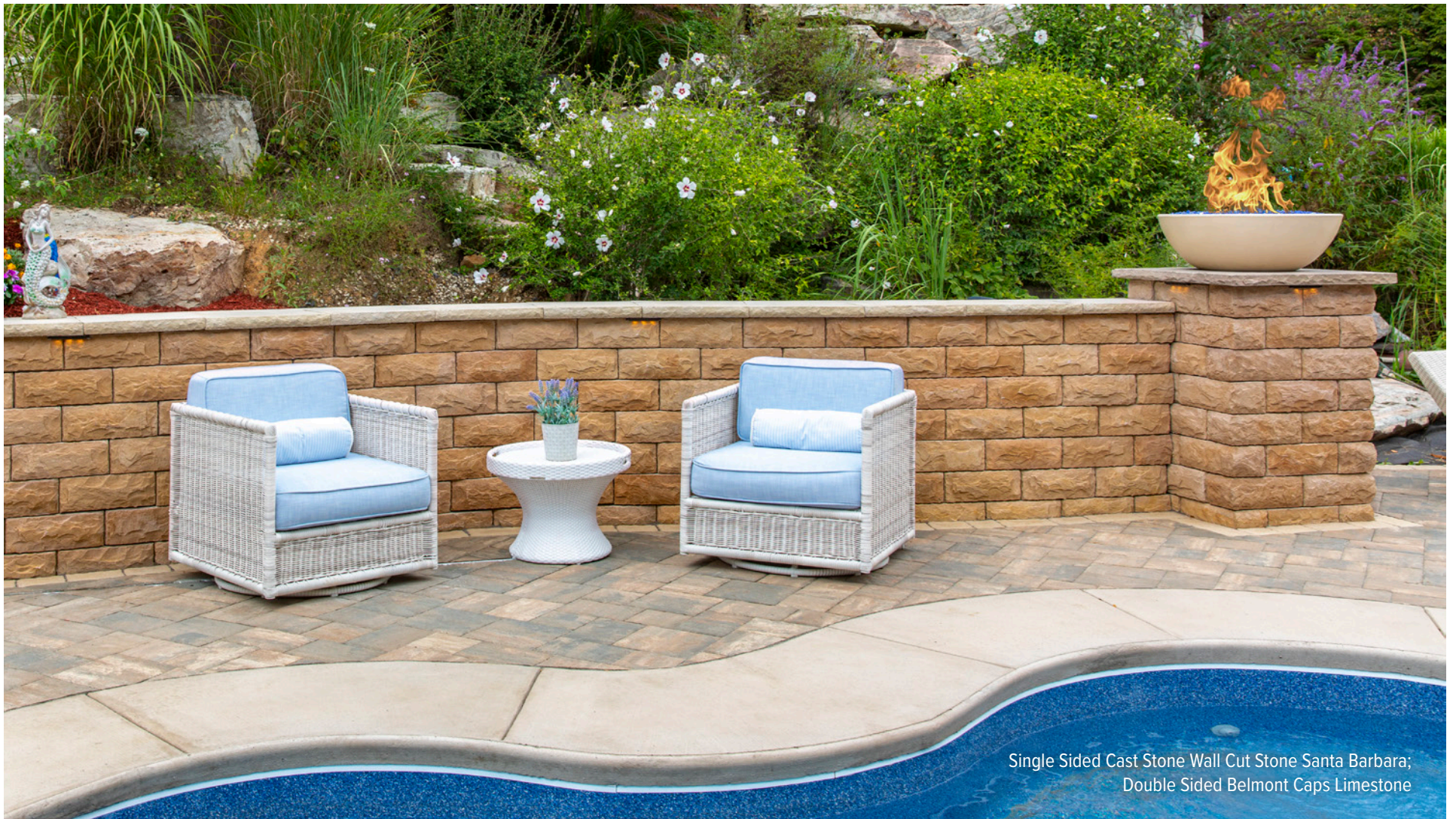
Single Sided Cast Stone Wall Cut Stone Santa Barbara; Double Sided Belmont Caps Limestone