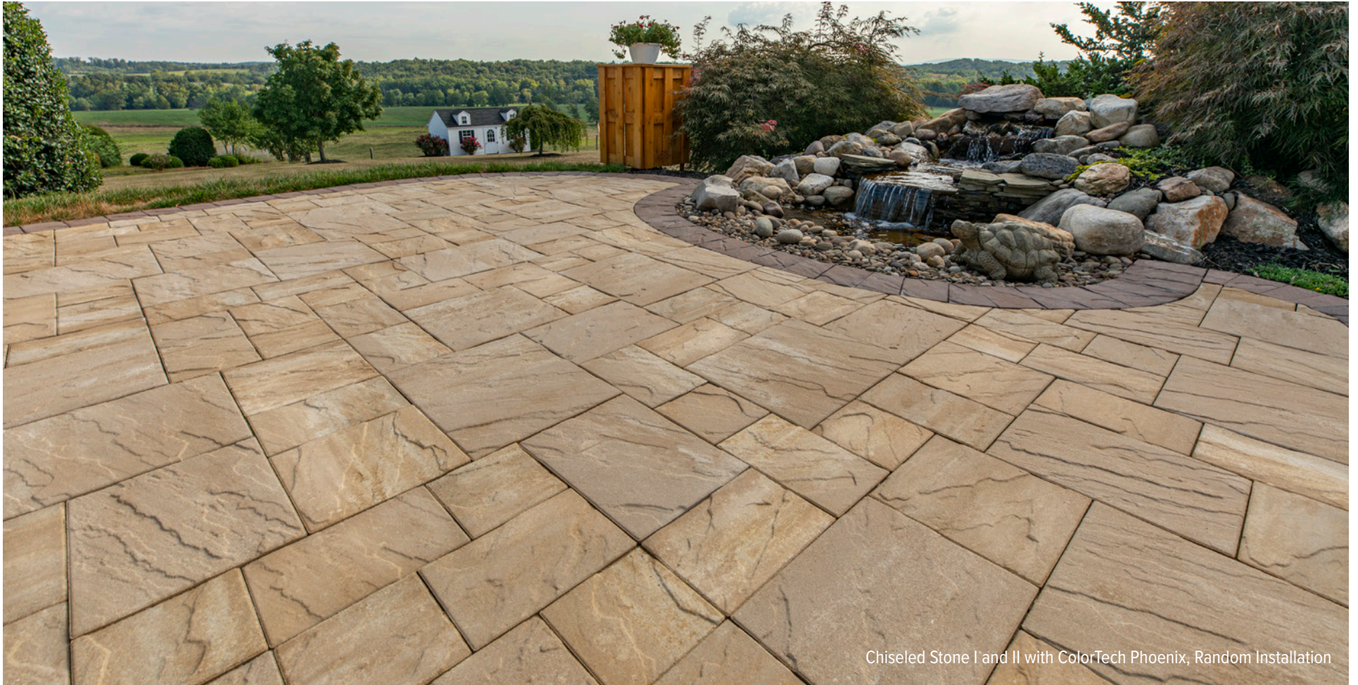
Chiseled Stone I and II with ColorTech Phoenix, Random Installation