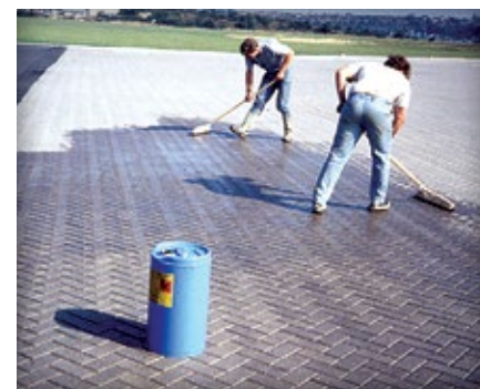
Figure 10. Urethane is applied with squeegees to stabilize joint sand between pavers on aircraft pavement.

For other applications, follow the sealer manufacturer's recommendation for application and for the protective gear to be worn during the job. With some sealers that recommend two coats, the first coat