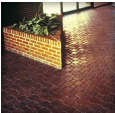
Figure 1. Many sealers enhance the appearance of concrete pavers and protect against staining.

Commercial stain removers available specifically for concrete pavers provide a high degree of certainty in removing stains. Many kinds of stains can be removed while minimizing the risk of discoloring or damaging the pavers. The container label often provides