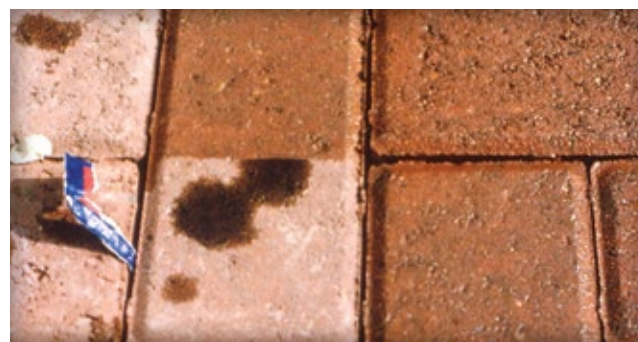
Figure 9. Sealers resist stains which makes them ideal for high use areas where they might occur.