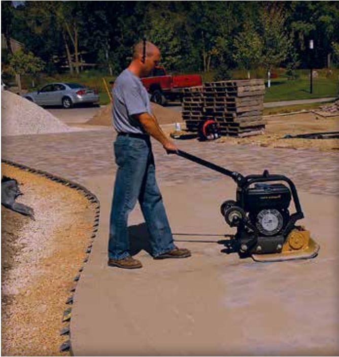
Figure 11. Vibrating sand into the joints.

the pavement. Pavers are cut with a double bladed splitter or a masonry saw. See Figure 8. A saw gives a smooth cut. Gaps greater than \frac{3}{8} in. (10 mm) should be filled with cut pavers. For street applications do not cut pavers to less than \frac{1}{3} their original size. Instead fill voids with two cut pavers.