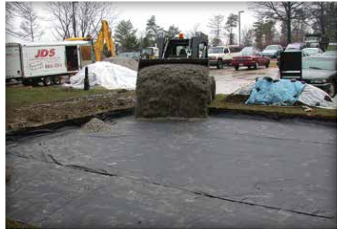
Figure 3. Application of the geotextile under aggregate base.