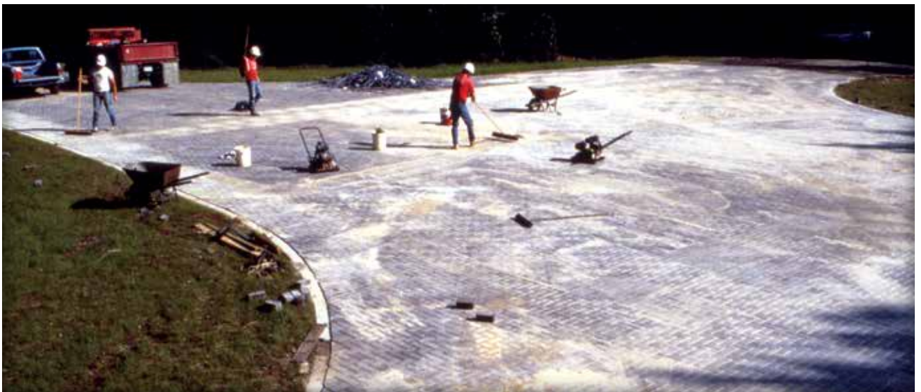
Figure 12. Excess sand swept from the finished surface will make the pavement ready for traffic.

Final surface elevations should not vary more than \pm\frac{3}{8} in. ( \pm 10 mm) under a 10 ft (3 m) straightedge, unless otherwise specified. Bond or joint lines should not vary \pm\frac{1}{2} in. (13 mm) over 50 ft (15 m) from taut string lines. The top of the pavers should be \frac{1}{8} to \frac{3}{8} in. (3 to 10 mm) above adjacent catch basins, utility covers, or drain channels, with the exception of areas required to meet ADA design guideline tolerances. The top of the installed pavers may be \frac{1}{8} to \frac{1}{4} in. (3 to 6 mm) above the final elevations to compensate for possible minor settling. A small amount of settling is typical of all flexible pavements. Optional sealers or joint sand stabilizers may be applied. See ICPI Tech Spec 5—Cleaning, Sealing and Joint Sand Stabilization