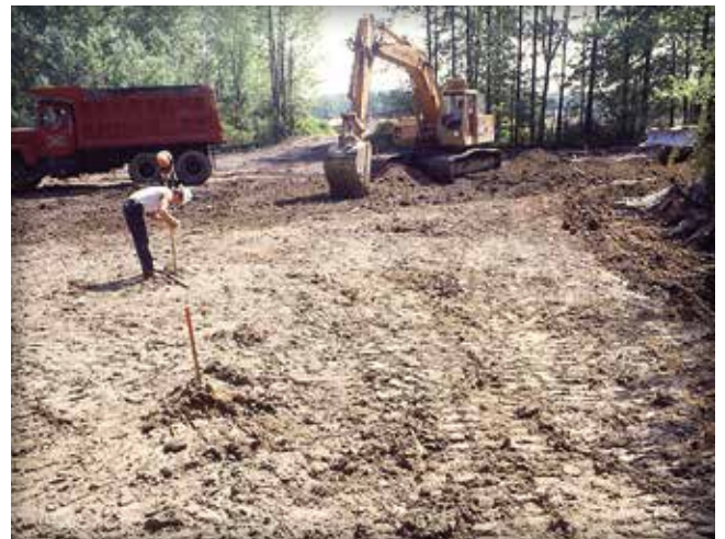
Figure 1. Excavation of the soil subgrade and placing grade stakes.

Installation steps include job planning, layout, excavating and compacting the soil subgrade, applying geotextiles (optional), spreading and compacting the sub-base and/or base aggregates, constructing edge restraints, placing and screeding the bedding sand, and placing concrete pavers. For larger installations mechanical placement of pavers may be more economical. Refer to Tech Spec 11—Mechanical Installation of Interlocking Concrete Pavements for additional information.