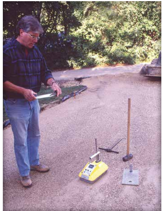
Figure 5. Density testing of the aggregate base with a nuclear density gauge.

Like compaction of the soil subgrade, adequate compaction of the base is critical to minimizing settlement of interlocking concrete pavements. See Figure 4. Special attention should be given to achieving compaction standards adjacent to edge restraints, catch basins and utility structures. When spread