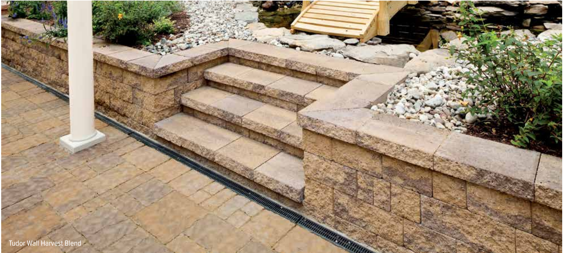
Tudor Wall Harvest Blend