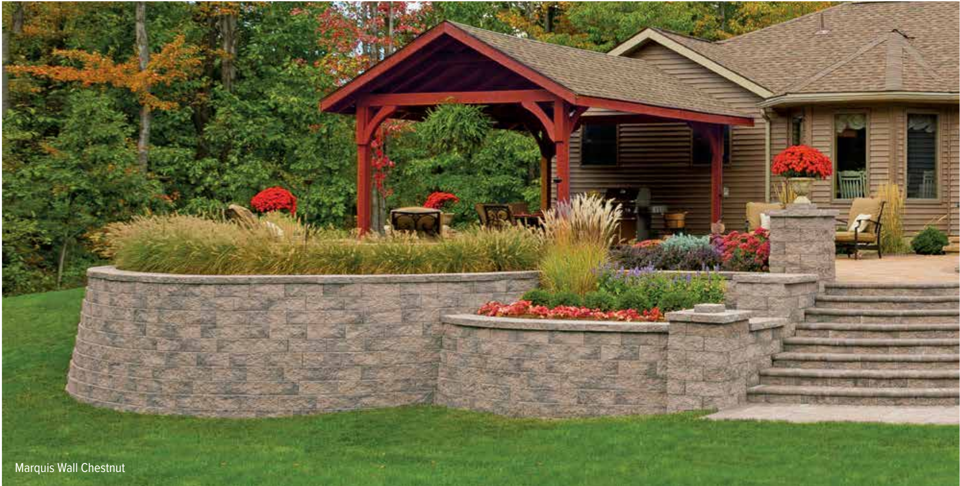
Marquis Wall Chestnut