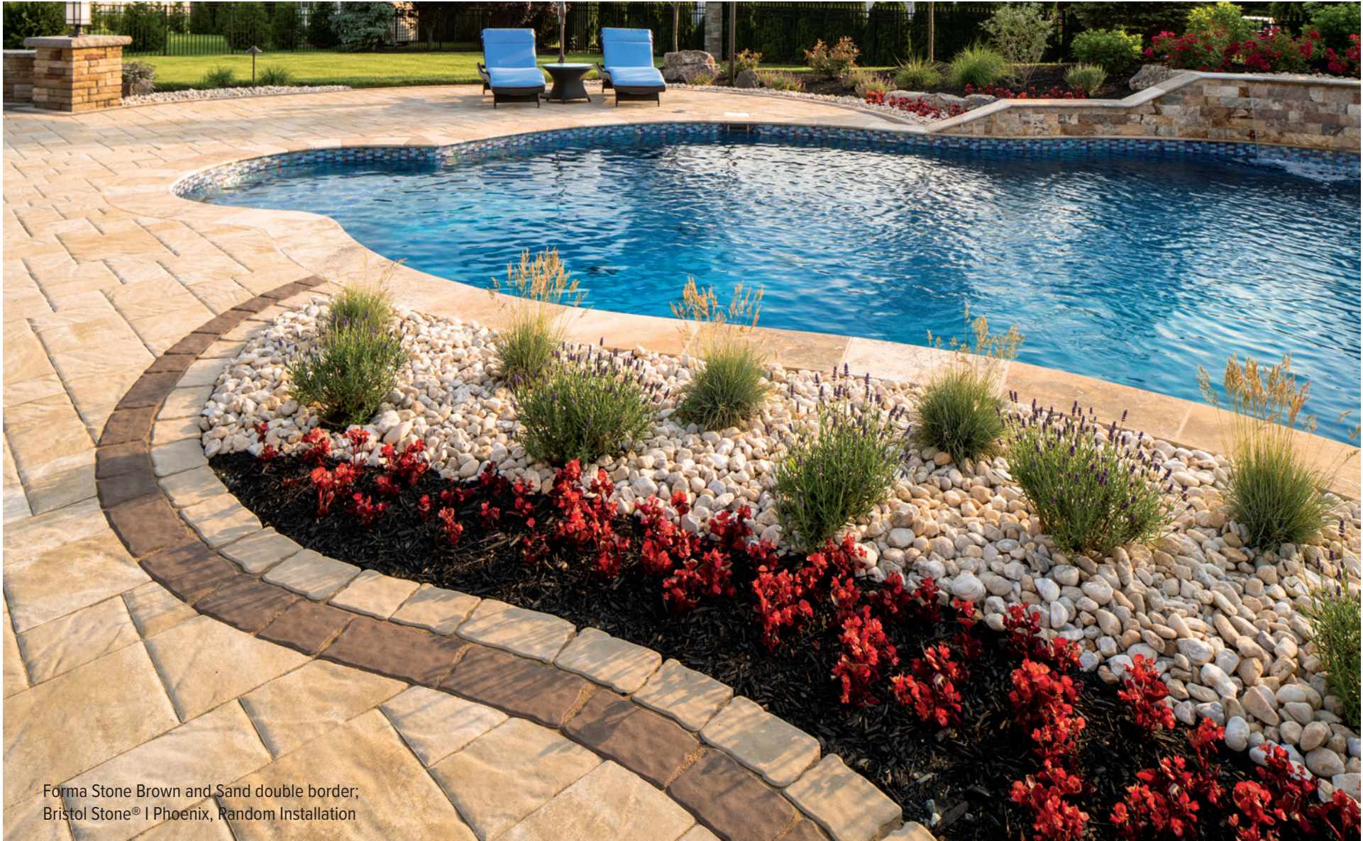
Forma Stone Brown and Sand double border; Bristol Stone® I Phoenix, Random Installation