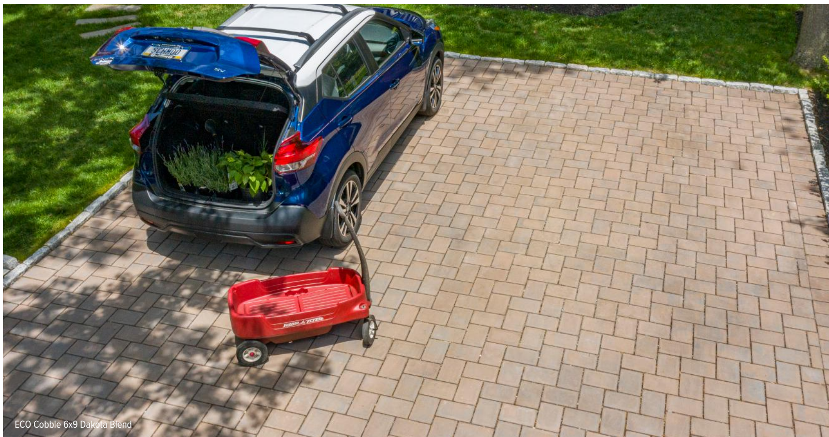
ECO Cobble 6x9 Dakota Blend