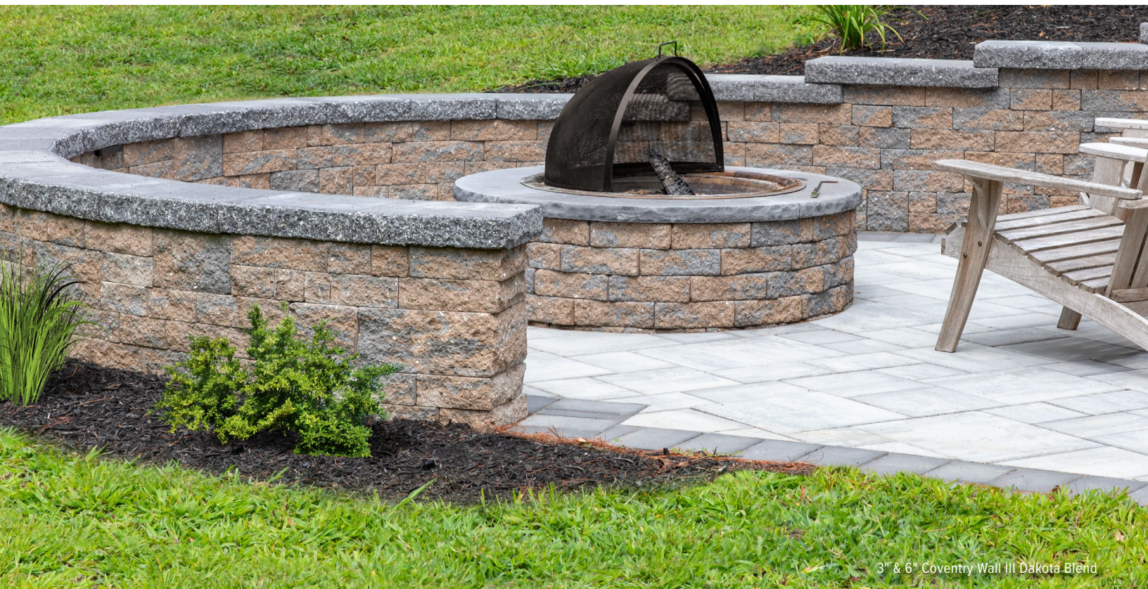
3" & 6" Coventry Wall III Dakota Blend