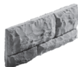
RANDOM FACE SHELLS STRETCHER