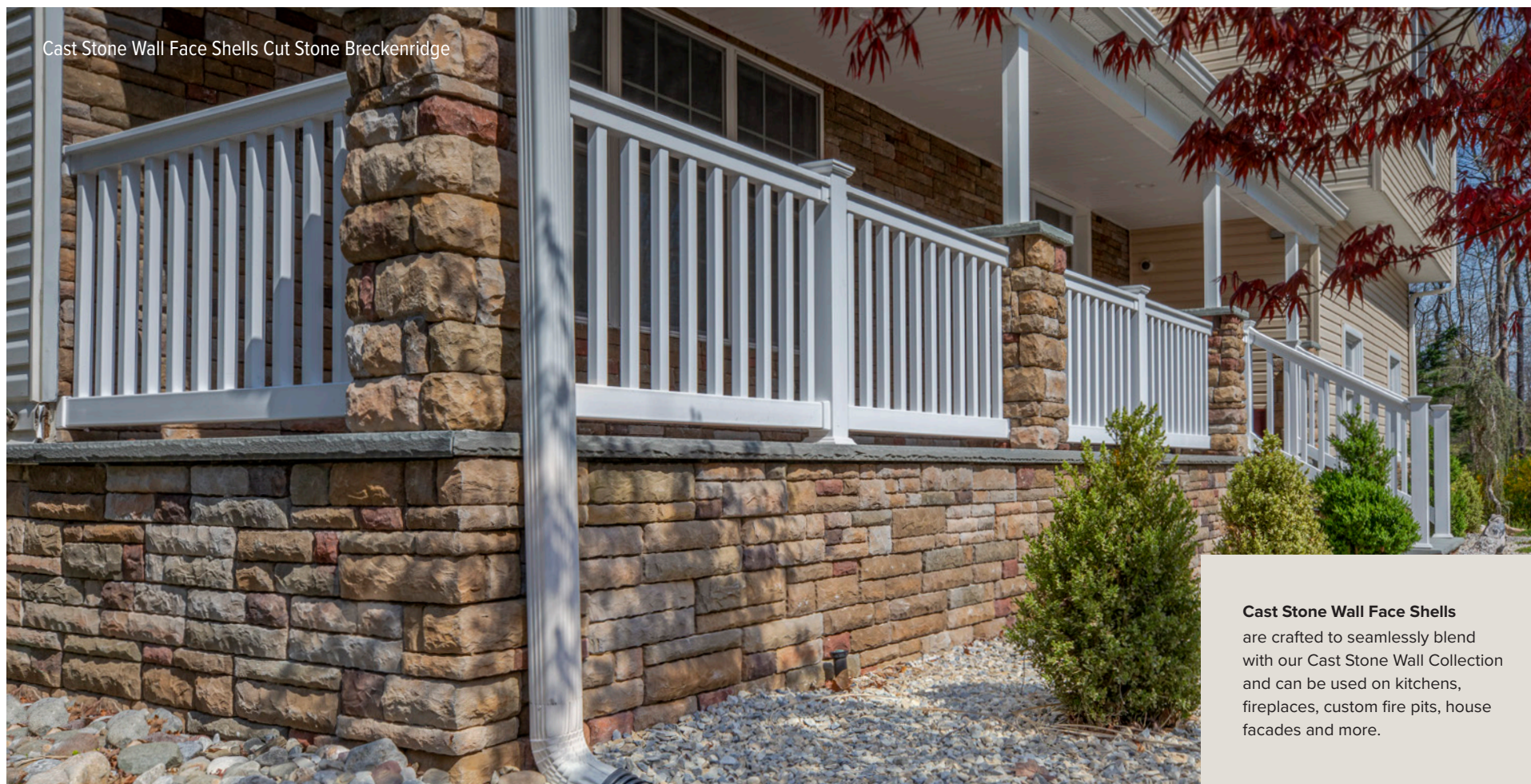
Cast Stone Wall Face Shells Cut Stone Breckenridge

Cast Stone Wall Face Shells are crafted to seamlessly blend with our Cast Stone Wall Collection and can be used on kitchens, fireplaces, custom fire pits, house facades and more.