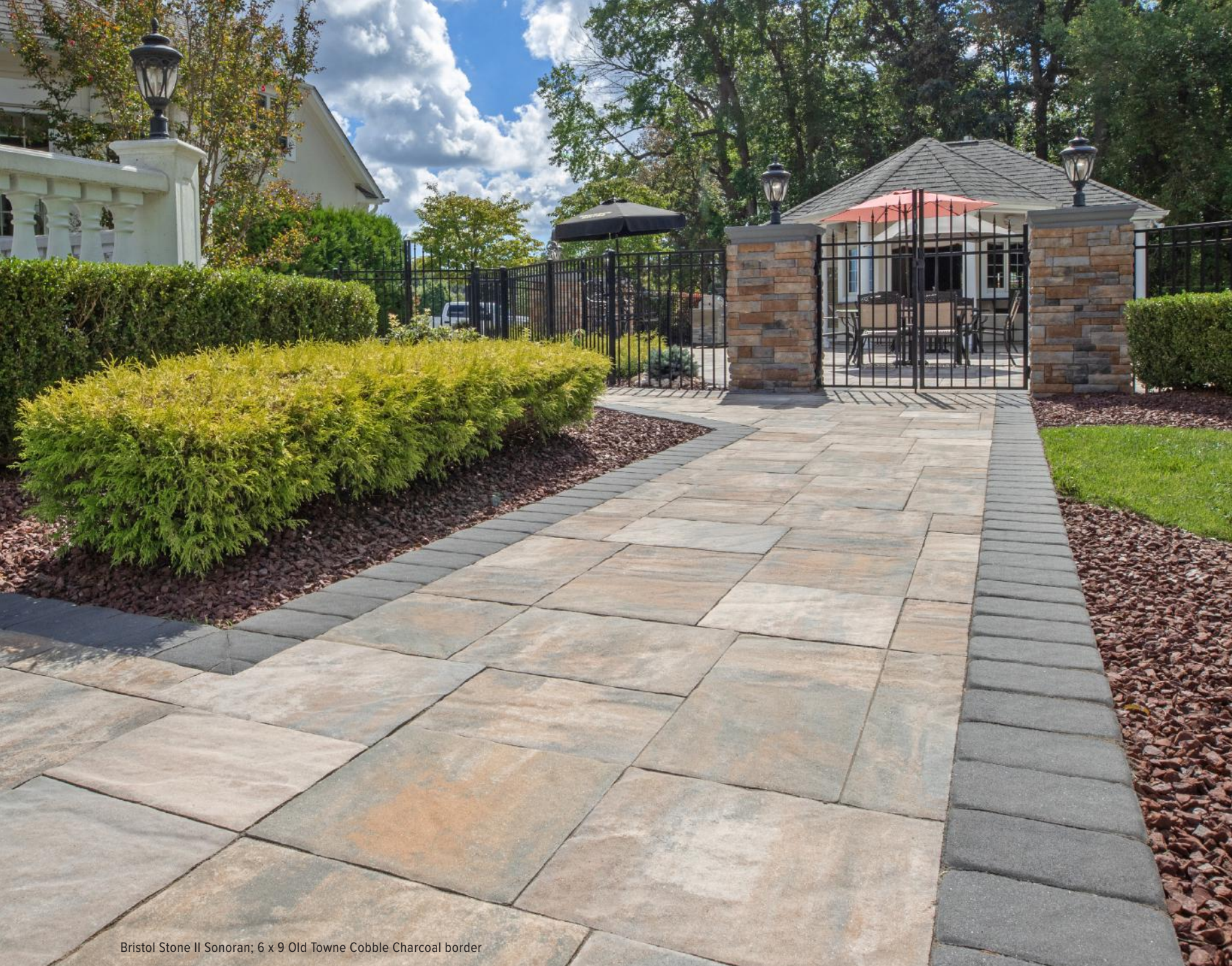
Bristol Stone II Sonoran; 6 x 9 Old Towne Cobble Charcoal border