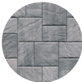
Pewter Blend ‡

All colors offered with or without ColorTech. *Premium color Enlarged swatches on pages 80-81