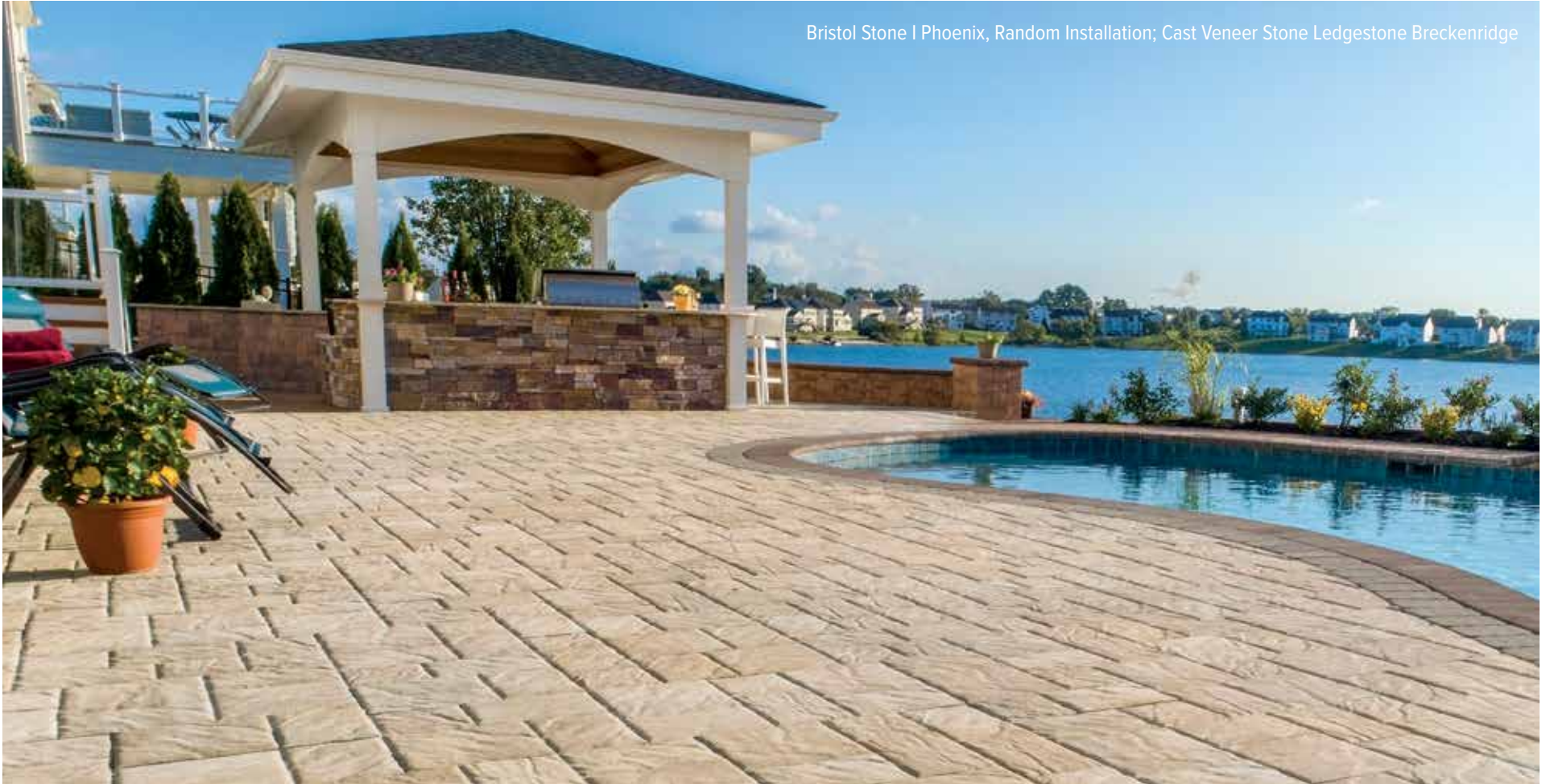
Bristol Stone | Phoenix, Random Installation; Cast Veneer Stone LedgeStone Breckenridge