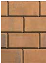
Harvest Blend 16