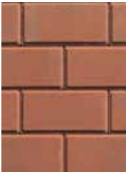
Autumn Blend 16