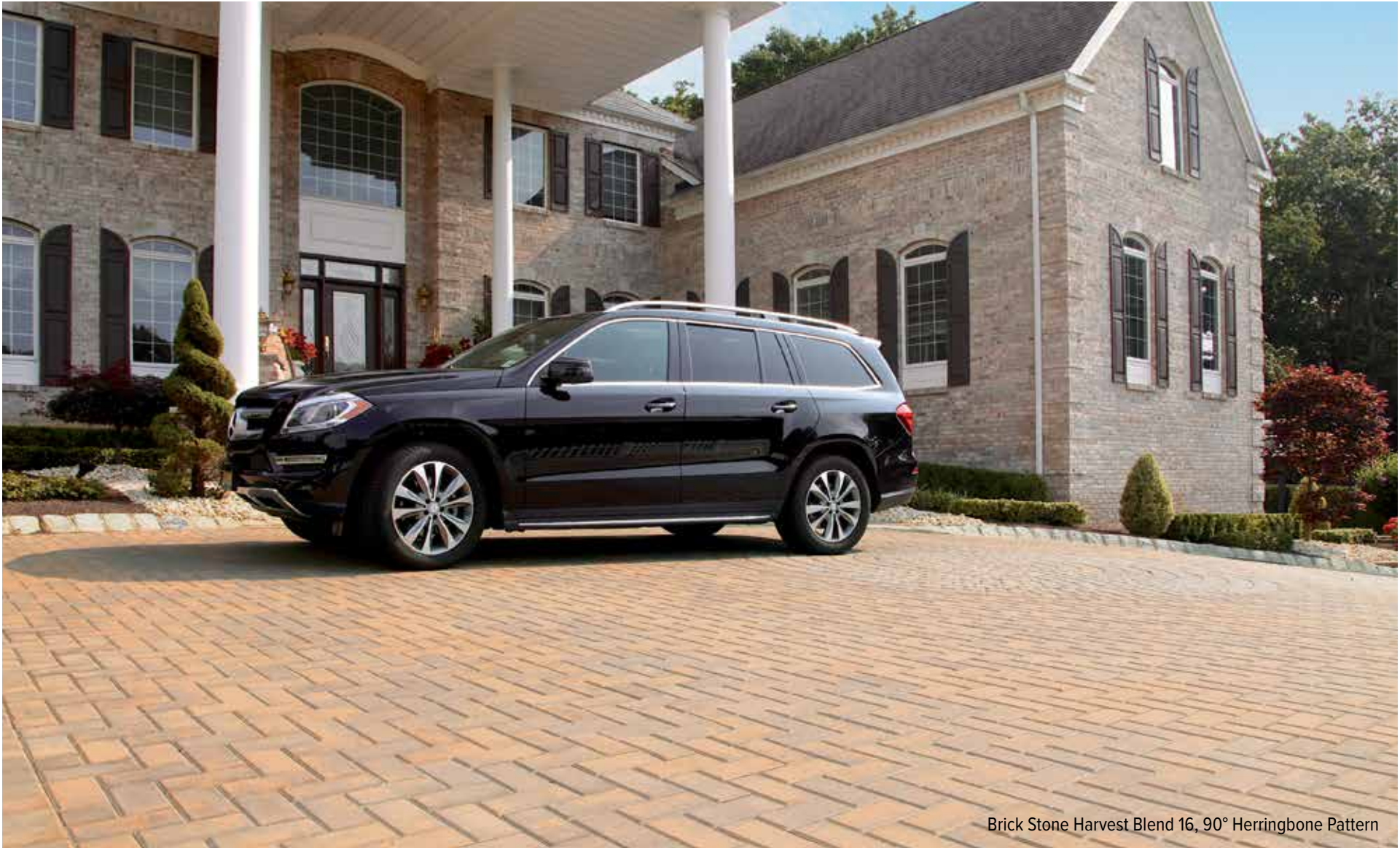
Brick Stone Harvest Blend 16, 90° Herringbone Pattern