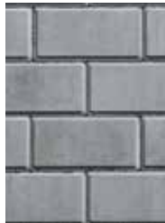
Pewter Blend 16