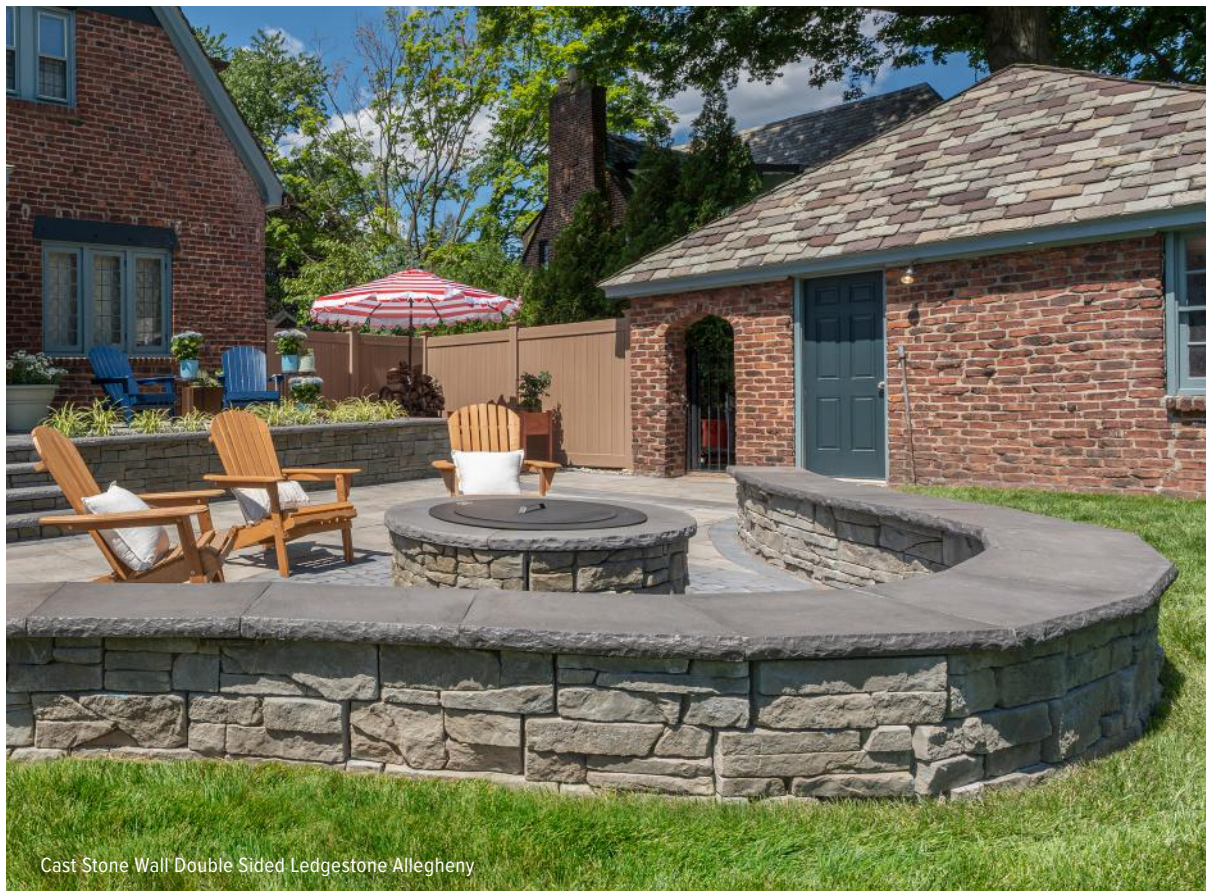
Cast Stone Wall Double Sided Ledgestone Allegheny