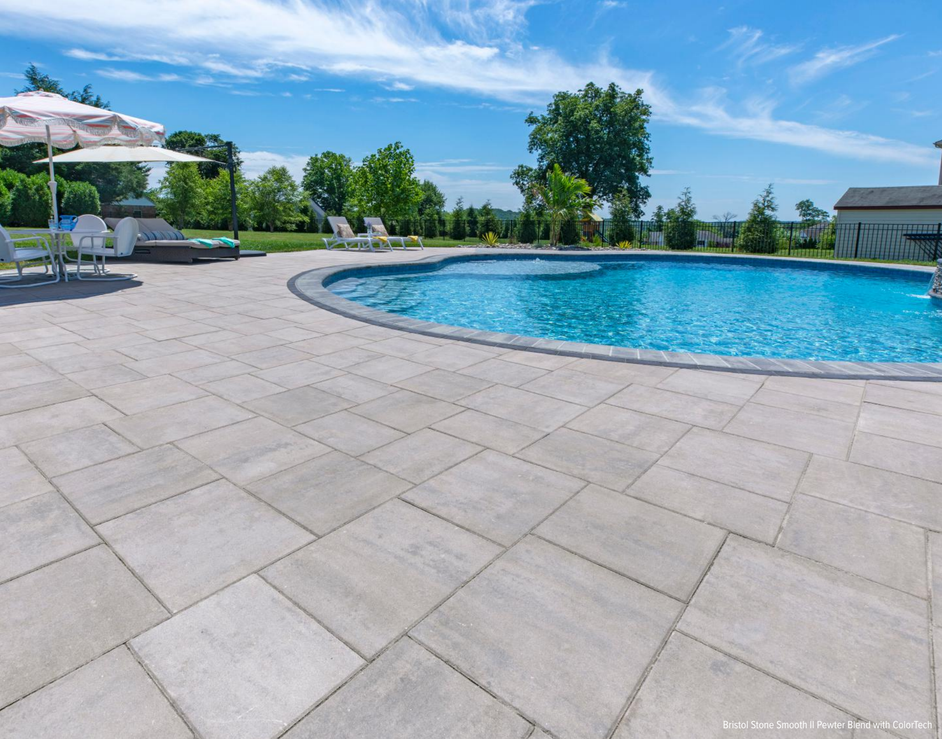
Bristol Stone Smooth II Pewter Blend with ColorTech